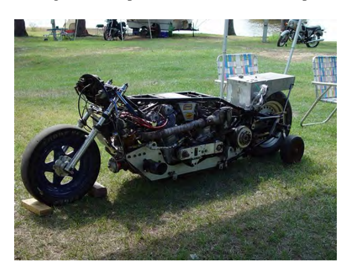
601 without bodywork

Ed is the owner/builder of No. 601. He is a retired Bell Helicopter engineer, a long time race car and race bike builder and a great supporter of the NTNOA. No. 601 runs two turbocharged, fuel burning, "old" Triumph Trident push-rod engines. Together they make more than 450 horsepower. The partially streamlined bike weighs 1,000 lbs. It holds various class records as high as 238mph and has exceeded 260mph.