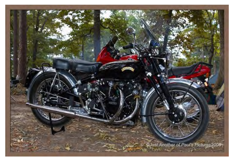
Vincent Black Shadow