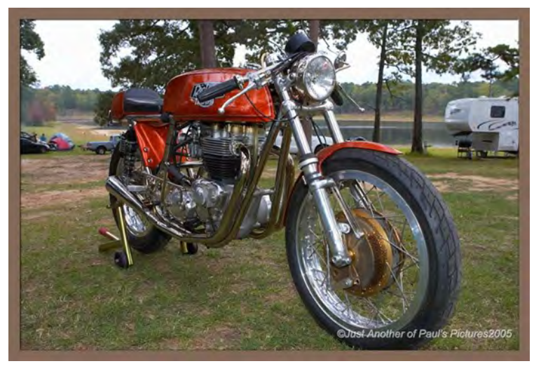
Rickman Triumph by RPM Cycle