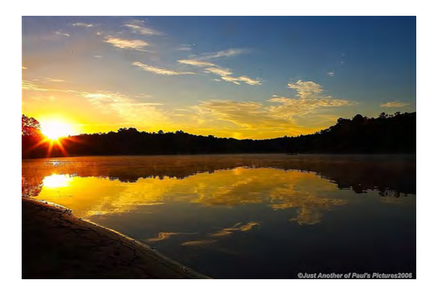
Sunrise at LOP

The 2006 Lake O' the Pines Rallye was our 22nd Annual event. It featured <u>Sam</u> Wheeler as Grand Marshal. It drew over 450 people and a display of over 100 bikes.