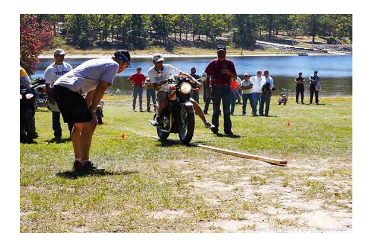
Ride the plank. Part of the field events we recently added to the festivities.