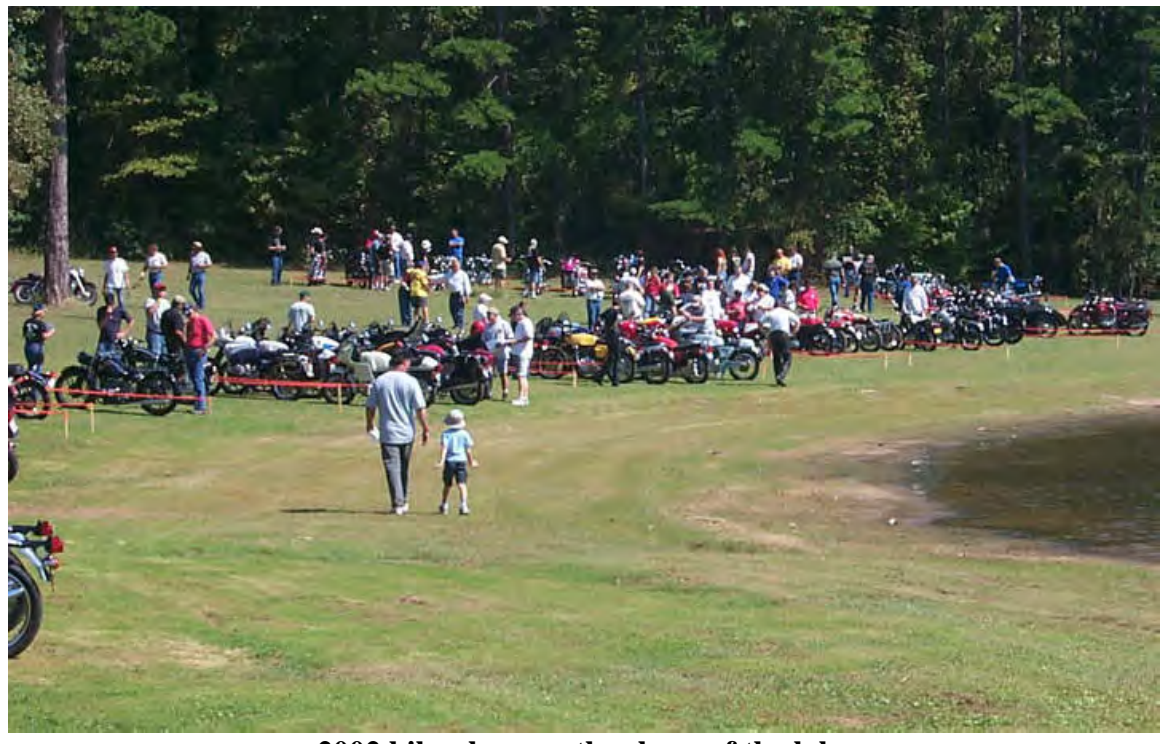
2002 bike show on the shore of the lake