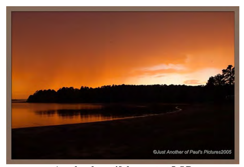
Another beautiful sunset at LOP