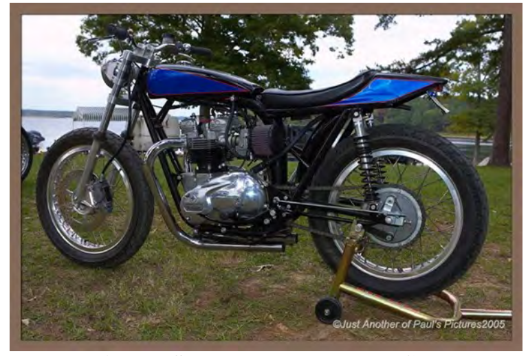
Triumph Street Tracker by RPM Cycle