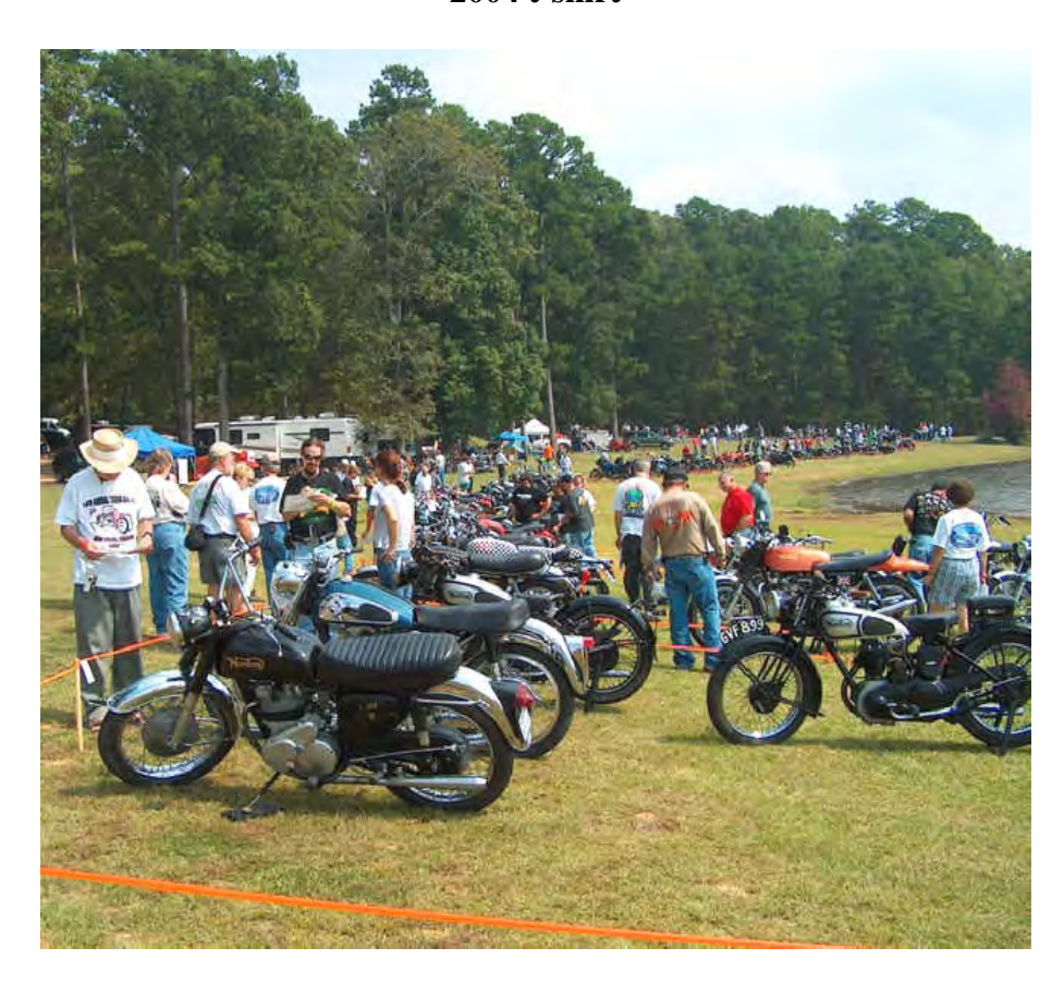
2004 bike show