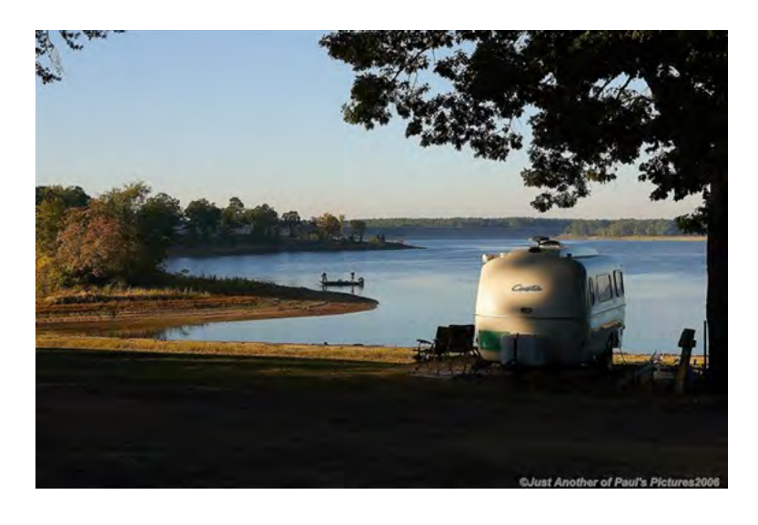
Another successful rallye!