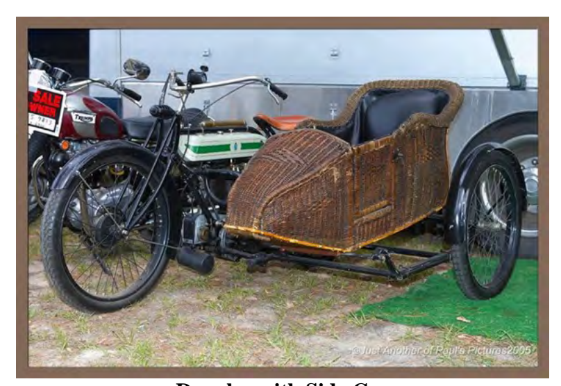
Douglas with Side Car