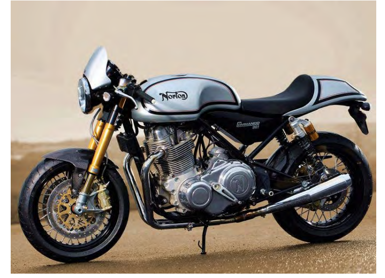
• SINGLE SEAT • DUAL SEAT