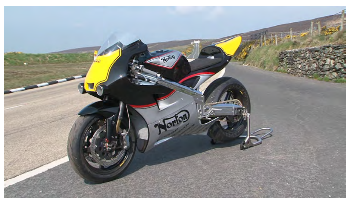
Norton NRV 588 – Isle of Man

Norton will race because racing is an essential part of our make-up – past, present and future. As in the past, Norton will make street specific and race specific motorcycles. Often, what is learned and developed on the track can be applied to street bikes, but when racing at the world class level, they are distinctly separate endeavours. To confuse the two will only compromise both.