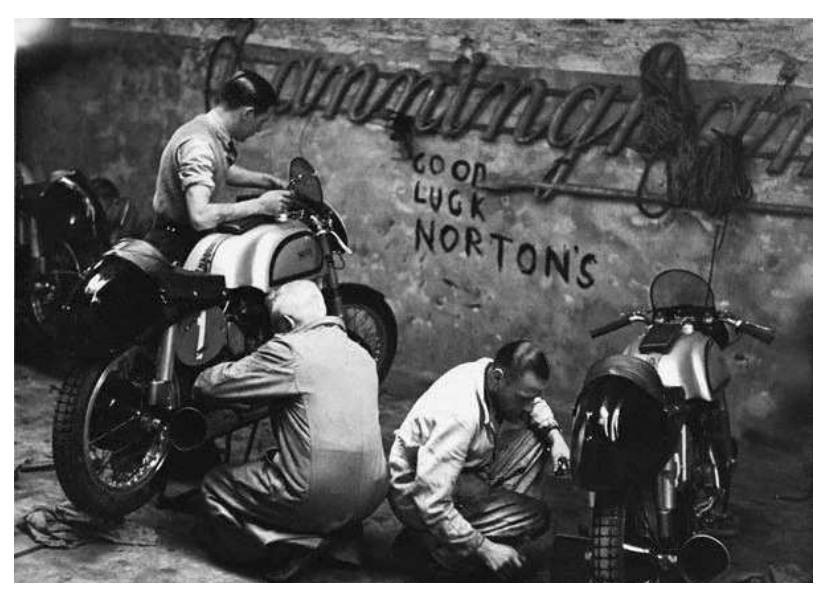
Isle of Man – 1950 – Preparing for the Tourist Trophy race

circuit, near the so traditional heart of the motorcycle British industry in Birmingham. We proudly continue the legacy and assume the mission designing, of engineering and building motorcycles that reflect the best of this iconic brand; а brand that created some of the most stunning and competent road-going motorcycles ever produced.