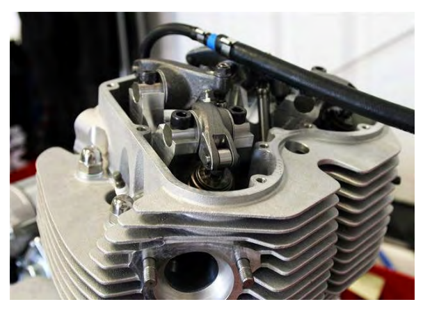
961 top end

Engine cases and barrels are cast in England of LM25 alloy, as are the LM4TF alloy cylinder heads. Engine Control Units are by Omex in Cheltenham UK, and throttle bodies are by Jenvey Dynamics in Shropshire UK.