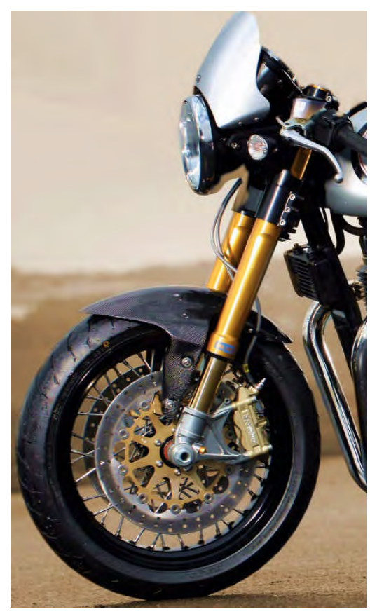
Ohlins FG511 forks and Brembo radial callipers

Road manners are further enhanced by employing confidence inspiring and fully adjustable Ohins suspension both front and rear, while braking tasks are handled by premier Brembo Gold Line radial callipers, discs and master cylinders.