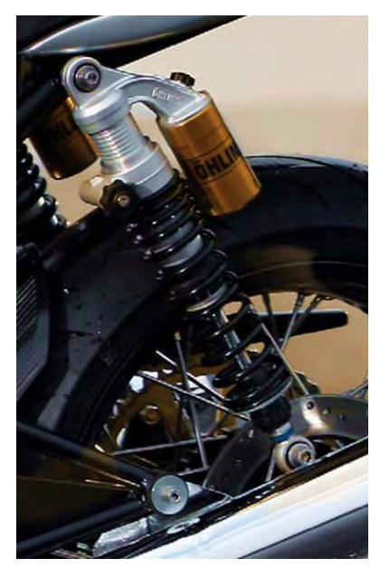
Ohlins 36PRCLB Rear Shock