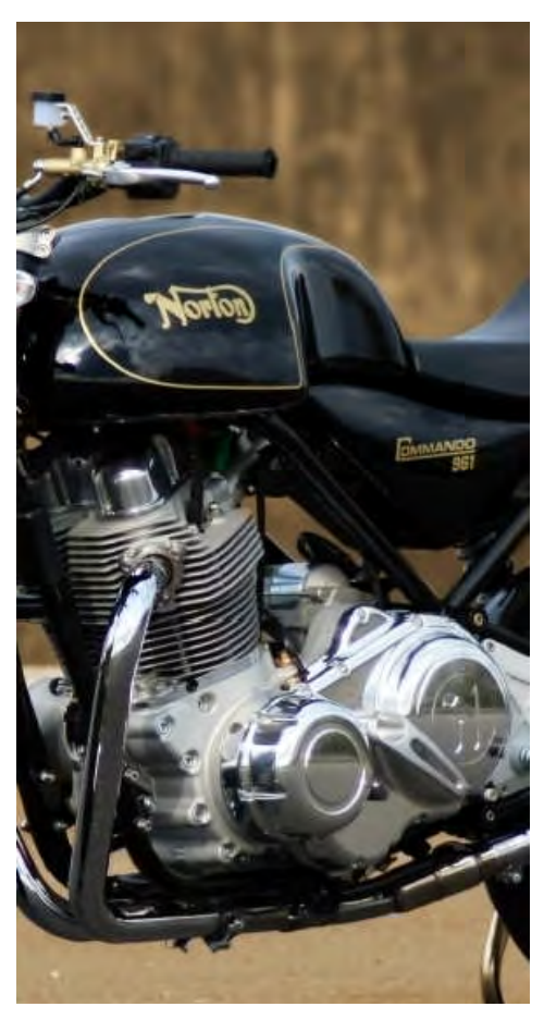
Commando 961 Sport